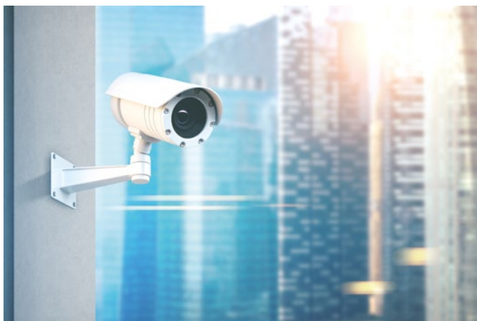
Figure 2: Video Surveillance is becoming smarter and more effective than ever

While there are many elements in a surveillance system, it could be said that a critical one is the storage solution. The days of racks of VCRs (video cassette recorders) storing analog CCTV feeds are, essentially, behind us. Today's digital IP solutions rely on HDD (hard disk drive) storage coupled with server hardware to gather digital video feeds, storing the compressed video they receive. While many storage providers offer HDDs tuned to the needs of surveillance, these only really target cost-optimised implementations. A COTS (commercial off-the-shelf) DVR or NVR (digital or network video recorder) featuring a single drive may simply be located in a store's backroom or the office of security staff. Here there is little regard for the environmental conditions (temperature, humidity, etc.) spinning platter storage requires, while the number of IP cameras in use, and hence data generation, will likely be fairly limited.