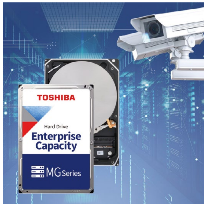
Figure 3: Toshiba Enterprise Capacity Hard Drive – MG Series

Secure Logiq's in-house testing facilities for the development of surveillance systems are a prerequisite for achieving the performance levels the enterprise end of the surveillance market requires. This is achieved using an in-house tool, Logiqal Benchmark, that allows virtual IP surveillance systems to be configured to test hardware in conjunction with the various VMS (video management software) offerings available. However, a storage supplier that also both understands the technical challenges and has laboratories for experimentation is of immense help for the customer.